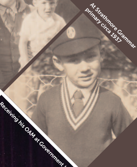
At Strathmore Grammar primary circa 1937